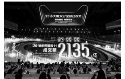
A screen shows total sales at over 213.5 billion yuan (30.7 billion USD) shortly after the end of the 11.11, or "Singles Day" shopping festival

Singles Day was originally set aside as an unofficial day for China's unmarried, but Alibaba latched on to it a decade ago as a shopping promotion