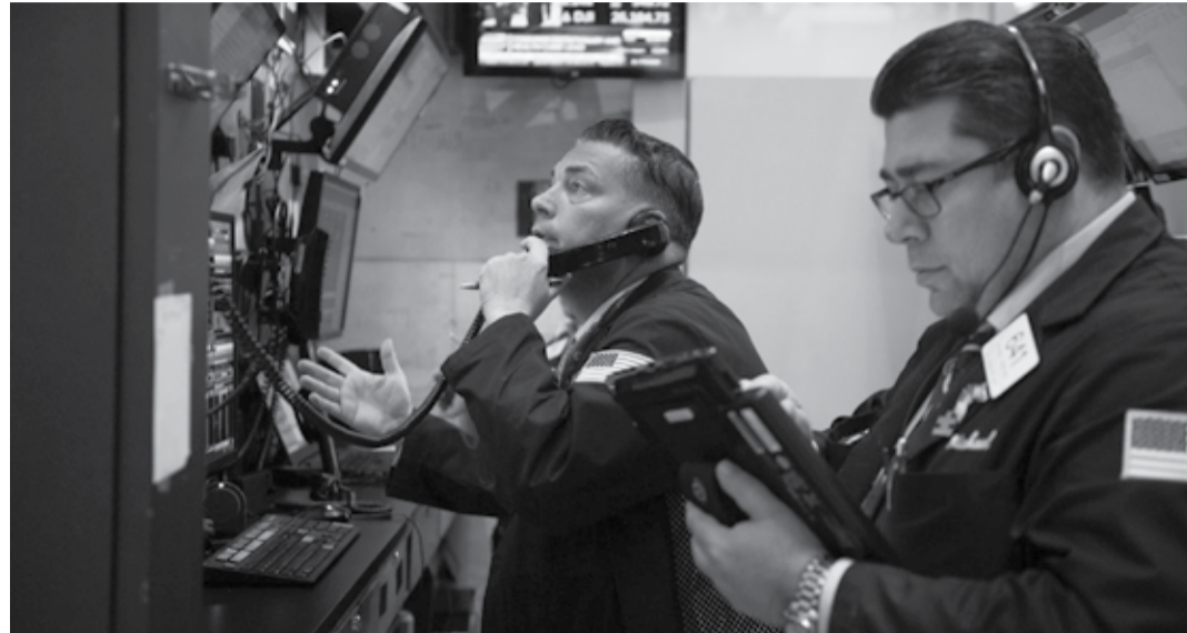
Traders work on the floor at the closing bell of the Dow Industrial Average at the New York Stock Exchange

In the eurozone, the Frankfurt and Paris stock markets dropped