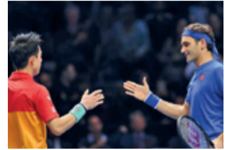
Japan's Kei Nishikori (L) greets Switzerland's Roger Federer after winning their singles round robin match