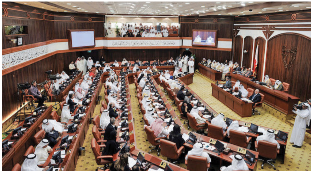
Trade unions say reserving seats in parliament would bring more welfare to the labour sector.