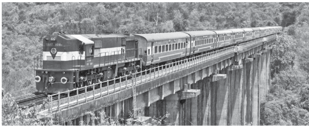
Konkan Railway is undoubtedly an engineering marvel.

A student who opted for his graduation in Physics after his Grade 12th examination says, "People around, look at me as if I have committed a grave crime! They just cannot digest the fact that I did not join engineering in spite of scoring good marks." Few on condition of anonymity have even confessed that they took up engineering due to parental pressure. Their parents feel pressurised by the relatives and people around if their ward is not an engineer. Engineering has therefore become the profession