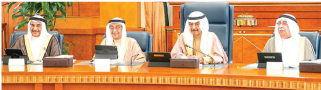
HRH the Premier chairs the Cabinet.

In another presentation, Works, Municipalities Affairs