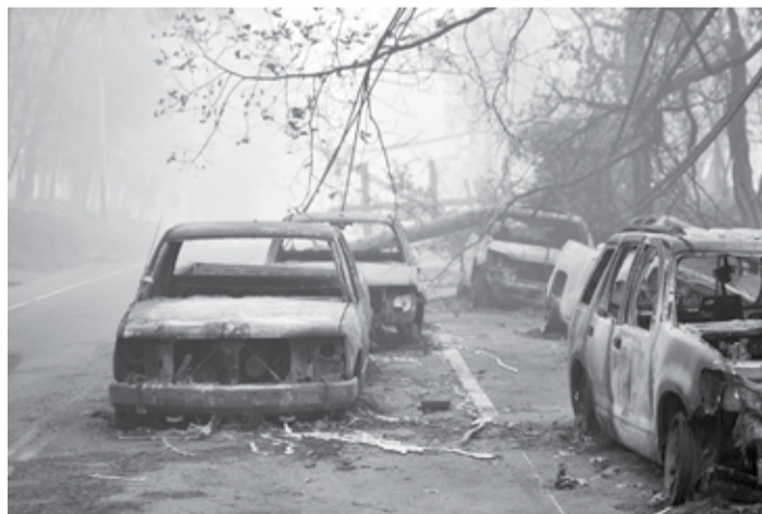
Burnt out vehicles are seen on the side of the road in Paradise, California

died in fire zones in north and south California, where acrid smoke blanketed the sky for miles, the sun barely visible.