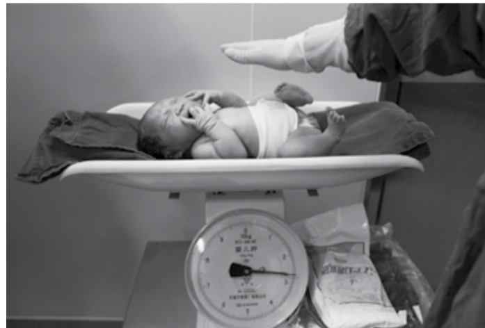
A newborn baby is weighed at a hospital in Hefei, Anhui province, China

The kilogram has been defined since 1889 by a shiny piece of platinum-iridium held in Paris. All modern mass measurements are traceable back to it