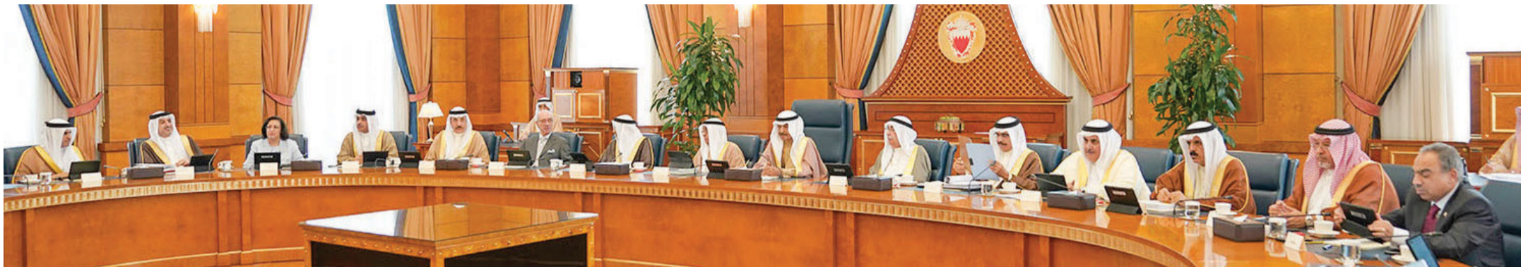
The Cabinet session in progress.

Cabinet approves Bahrain-India outer space co-operation