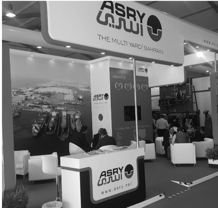
ASRY's kiosk at Abu Dhabi International Petroleum Exhibition and Conference (ADIPEC) showcasing its engineering and construction offering. The exhibition has over 2,200 exhibitors from 28 countries. "We are pleased to participate for the first time in this exhibition in line with launching a new division focusing on expanding our engineering and construction portfolio," ASRY Chief Executive Officer Andrew Shaw stated on the opening day of the exhibition

The minister also applauded Bahrain's achievements in renewable energy and energy efficiency, including the adoption of the policy of net metering, as well as the project to set up a 100 megawatts solar energy plant.