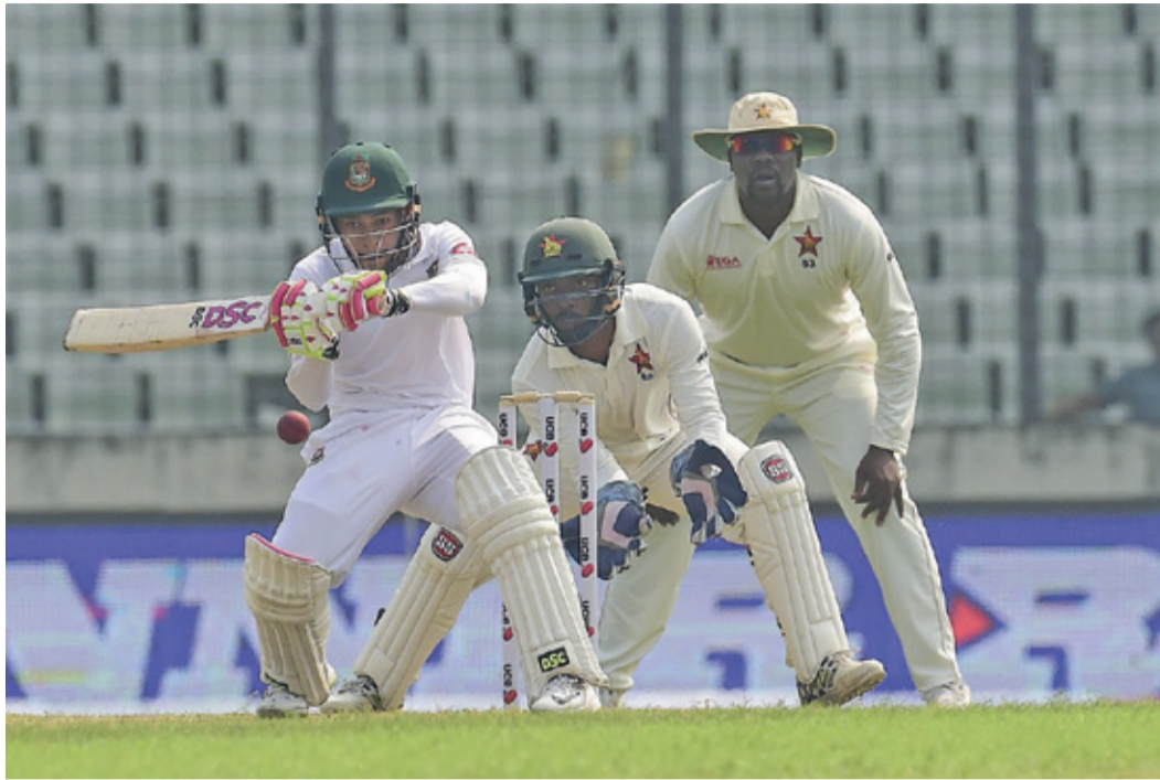
Bangladesh cricketer Mushfiqur Rahim (L) plays a shot as the Zimbabwe cricketer Regis Chakabva (C) and captain Hamilton Masakadza (R) look on

But it was Mushfiqur who shone, pulling leg-spinner Brendon Mavuta for a single at square leg after the tea break to become the first wicketkeeper-batsman ever to score two double tonnes