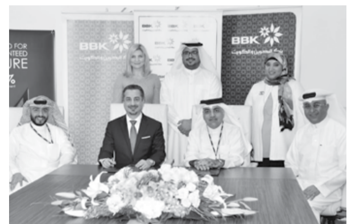
BBK and Kazerooni Contracting officials signing a Memorandum of Understanding (MoU) to provide mortgage financing to the customers of the "Kazerooni Heights" project