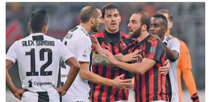
AC Milan's Gonzalo Higuain (R) argues with Juventus' Giorgio Chiellini (2ndL) after he received a red card