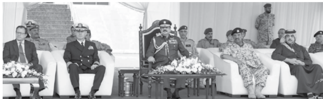
His Majesty along with other dignitaries watches flight demonstrations.