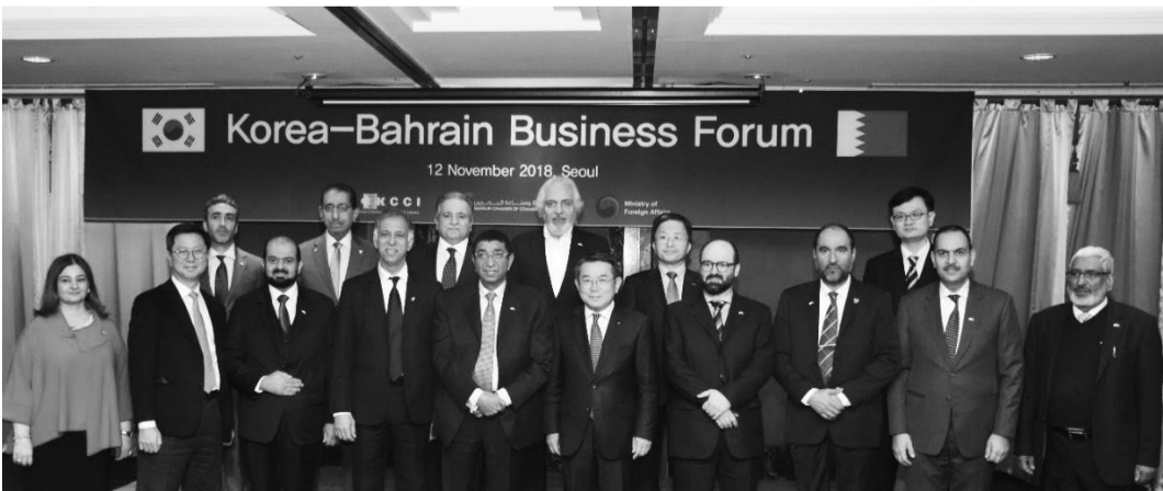
Participants of the Korea-Bahrain Business Forum during a group photo session

It is the first time that Bahrain's economic mission made