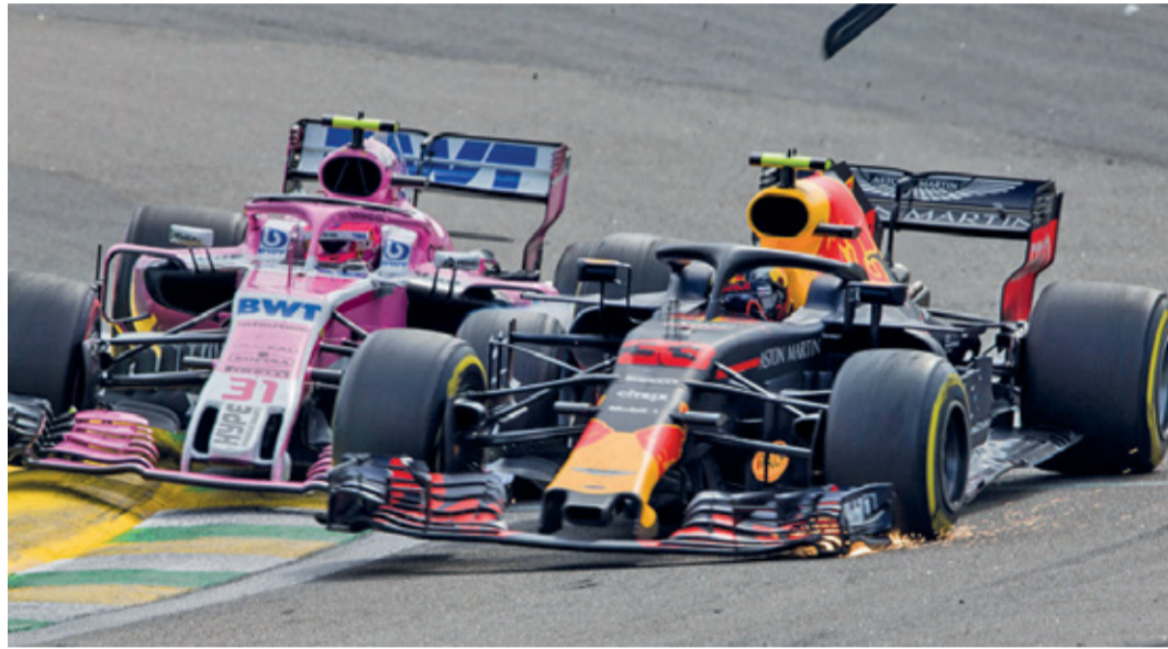
Max Verstappen of Red Bull Racing clashes with Esteban Ocon of Sahara Force India

"I was behind Max for two laps," Ocon told Sky Sports. "On the first lap, I was a lot faster