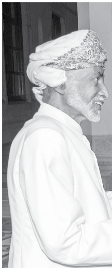
Oman's Sultan Qaboos meets with Israeli Prime Minister Benjamin Netanyahu to the Gulf country.

The 2002 Arab Peace Initiative, which has been re-endorsed repeatedly by the Arab League — most recently in 2017 — mapped the path toward such a just, comprehensive and warm peace. This proposal offered Israel a normalised and full relationship with the entire Arab world in return