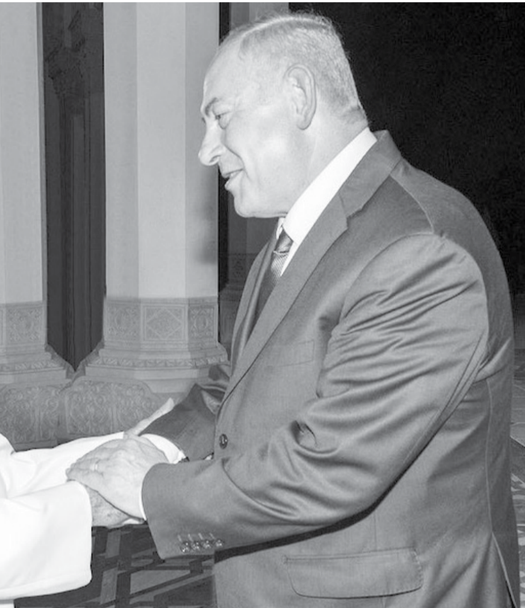
Prime Minister Benjamin Netanyahu in Muscat during the latter's unannounced visit

for a withdrawal from Arab lands illegally occupied since 1967, as successive UN resolutions have consistently demanded. Meanwhile, secretive bilateral understandings between Netanyahu and Oman's leadership, enjoying neither popular legitimacy nor the principals of international justice, are a recipe for the continuation of the tense and unjust status quo.