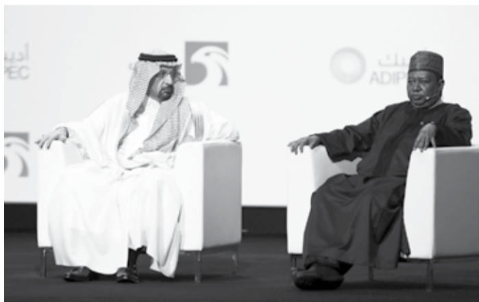
Saudi Energy Minister Khalid al-Falih (L) and OPEC Secretary General Mohammed Barkindo attend the Abu Dhabi International Petroleum Exhibition and Conference (ADIPEC)

"The technical analysis we reviewed yesterday shows that we need a reduction approaching one million bpd to balance the market," Khalid al-Falih told an energy conference in Abu Dhabi.